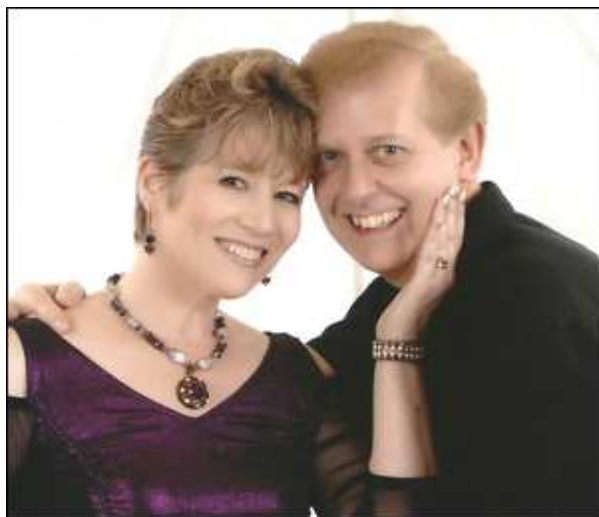
Plant City, Florida